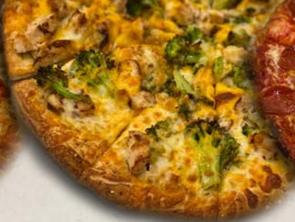
CHICKEN AND BROCCOLI