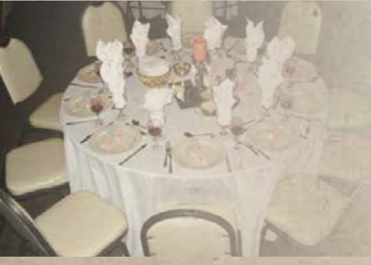
HAVE YOUR NEXT BANQUET AT GIANNILLI'S II

4816 State Route 30 Greensburg, PA 15601 724-832-5600 www.giannillis2.com